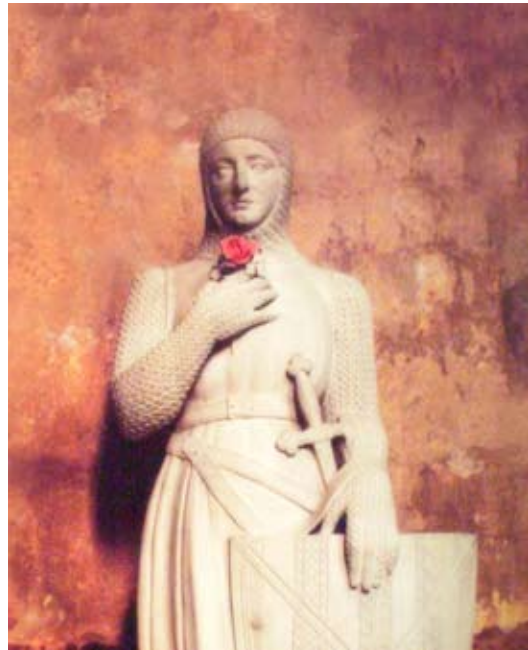
Knight with the Rose , Château d'Omonville.

Alas, why are we not still today under the genial authority of Pythagoras? The main trouble with today's world is the lack of silence. Not only is contemporary society literally poisoned by the tumult of machines (including talking ones), but also—and especially—it is saturated with loud and