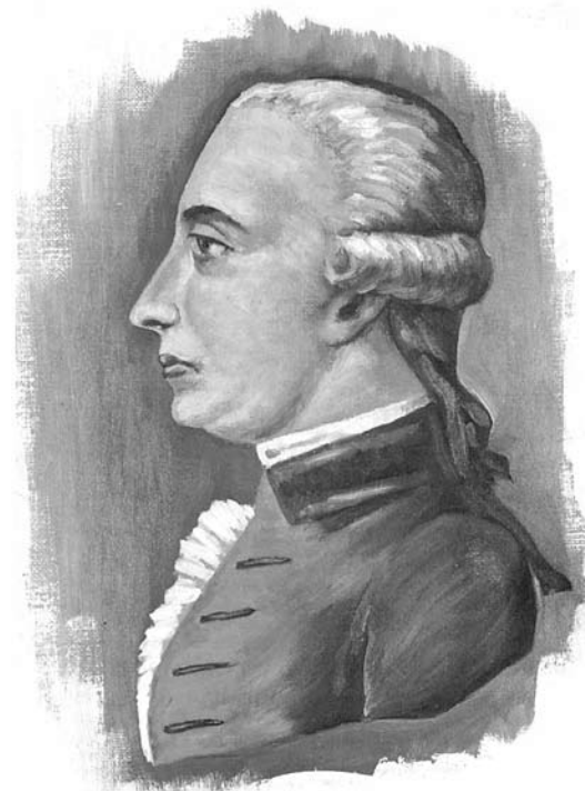
Louis Claude de Saint-Martin

Meditate upon this message; think about it often. It is hoped that it will help you to ascend one step higher on the ladder of spirituality.