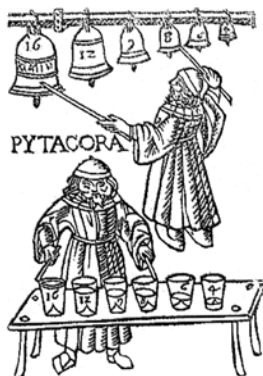
F. Gafurio, Pythagoras Experimenting with the Pitch of Tuned Bells and Water-filled Cups , in Theorica Musice , 1492.

Trying to escape a review of the day’s activities provides uncertainty that wrong things will not occur again. We feel helpless in our ignorance, and we worry as to future success. An intelligent survey of our acts is always to our advantage. Doubt and ignorance are the greatest causes of anxiety and worry, for they destroy self-confidence.